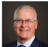
Hon. Doug Donaldson, Minister of Forests, Lands, Natural Resource Operations & Rural Development