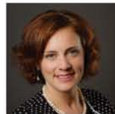
Hon. Michelle Mungall, Minister of Energy, Mines & Petroleum Resources