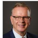
Hon. Bruce Ralston, Minister of Jobs, Trade & Technology