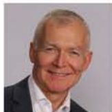
Hon. Scott Fraser, Minister of Indigenous Relations & Reconciliation