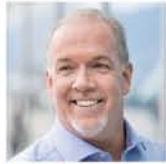
Premier John Horgan, Government of British Columbia