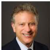
Hon. George Heyman, Minister of Environment & Climate Change Strategy