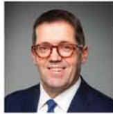
Bob Zimmer, MP, Prince George – Peace River – Northern Rockies