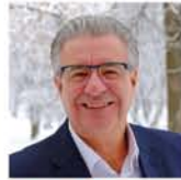
Mayor Lyn Hall, City of Prince George